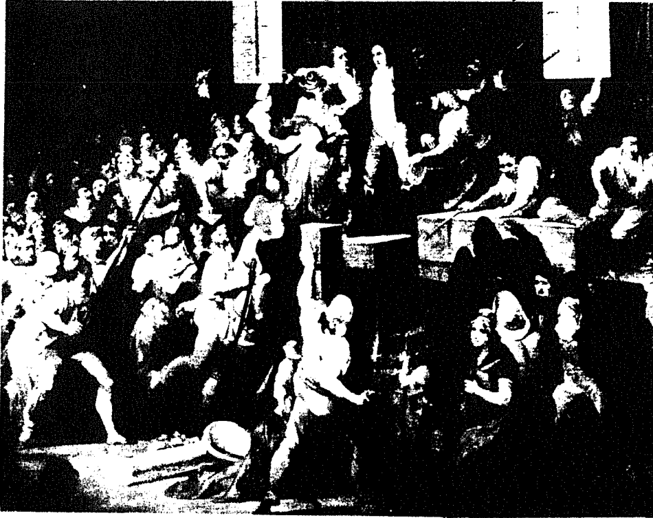
Convention invaded by sans culottes in Prairial

Although the overthrow of Robespierre was welcomed by both sides, the