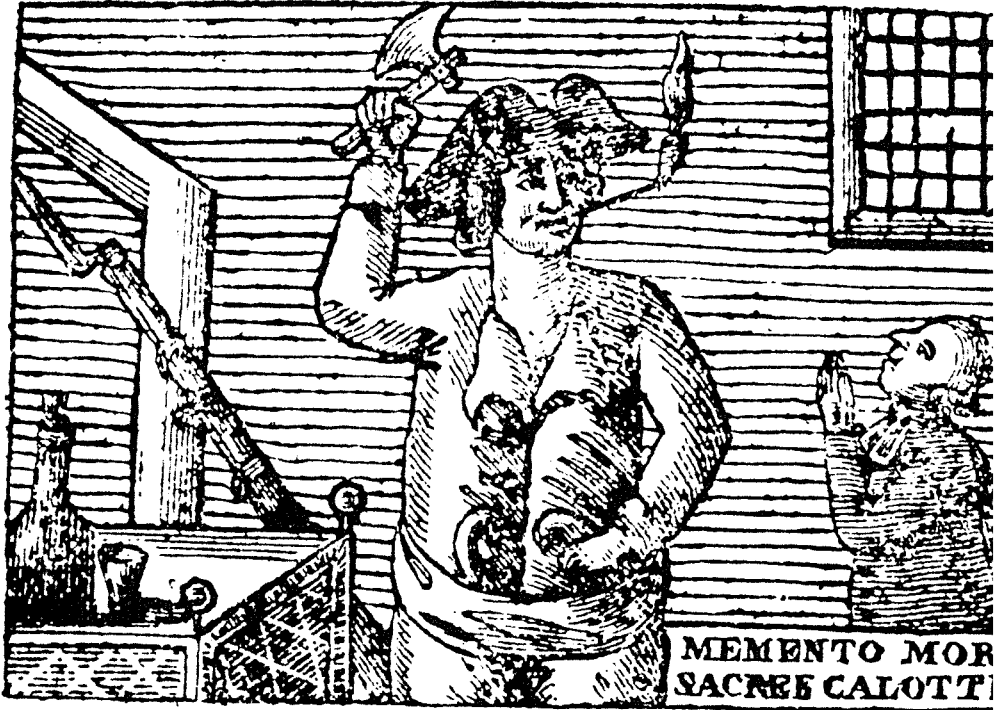
Le Père Duchesne

The Jacobins attack on the Hébertists must be seen in this context. The Hébertists as has been seen earlier were no selfless defenders of the sans culottes. They did however, often voice their concern and aspirations, being far closer to them socially than the Jacobins, who represented mostly the radical bourgeoisie. As such, the Hébertists had a better knowledge and rapport with the masses. The Jacobins onslaught on the Hébertistes should be seen not just as faction fighting but as an attempt to neutralise the sans culottes political role. In fact the defeat of the Hébertists were used as a way to eliminate many sans culottes from political positions which could be used to extend the revolution. The sans culottes political independence which was best illustrated by the role of the Parisian section gave the bourgeoisie sufficient grounds for concern. They used the Hébertists as a pretext for actually dismantling the sans culottes power base and consolidating the bourgeois revolution.