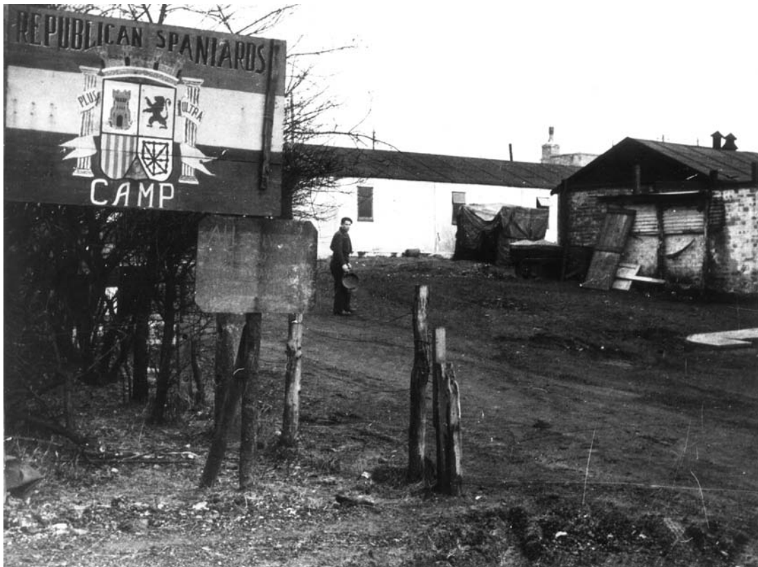
Figure 2: General view of the Chorley camp.