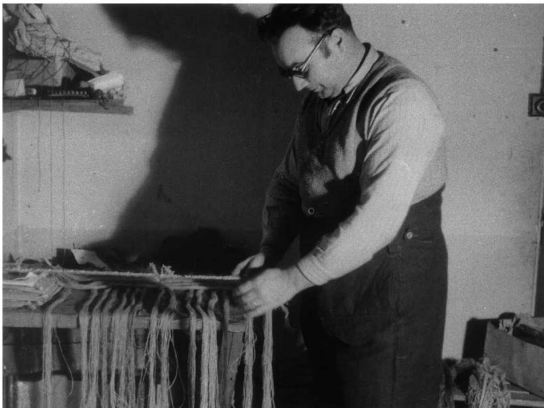
Figure 4: The prisoners were provided sackcloth to make alpargatas. Others made wooden toys.

Privations were, evidently, acute, but the local Committee and other supporters such as the anarchist Marie Louise Berneri organized relief for