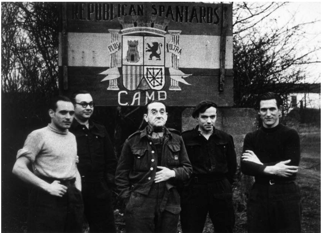
Figure 1: Spanish anti-fascist prisoners standing at the entrance to the Chorley camp. The authorities allowed them to erect this board so that they would not be confused by the local population with fascist POWs.