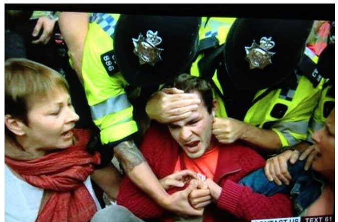
Caroline Lucas introduces her son to the violence inherent in the state

As with previous struggles in the 1990s, 'rainbow' alliances of hippies and outraged middle-Englanders can be a powerful and eclectic mix in environmental direct action campaigns, but they also illustrate the practical and ideological