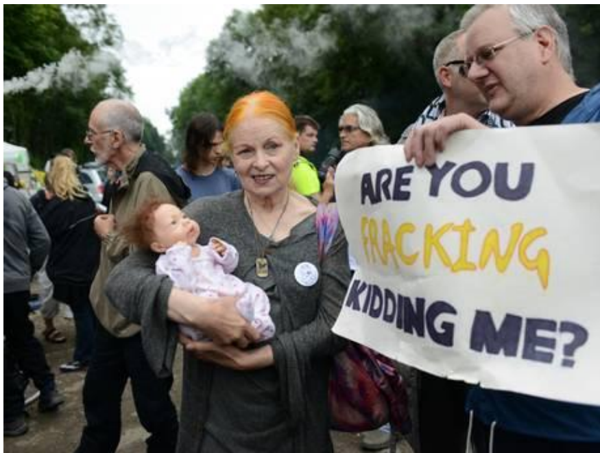
A local's response to Vivienne Westwood when she asked him to change her grandchild's nappy

protests. Therefore, all conditions were dropped and unconditional bail granted - a pattern that has been repeated at other court hearings since. 21 More recently, there were co-ordinated efforts between the police and local authorities to clamp down on the protests. For instance, in early September, West Sussex County Council (WSSC), who own the land where the BCPC is based, began the first stage of eviction proceedings by serving a notice to quit on the camp. The following day, the police also imposed S14 restrictions of the Public order Act (POA), meaning that protests were only supposed to happen in an enclosed pen away from the site entrance. These attempts to stifle the protests were largely ignored, and the struggle continues undiminished at the time of writing this article. In a final ironic twist, the campaign had a minor victory in the High Court on 16/9/13 when the judge rejected WSSC's eviction claim as 'flawed' on the grounds that they had not considered the right to protest, and adjourned the case till 8/10/13, which is after the imposed deadline on drilling operations, and