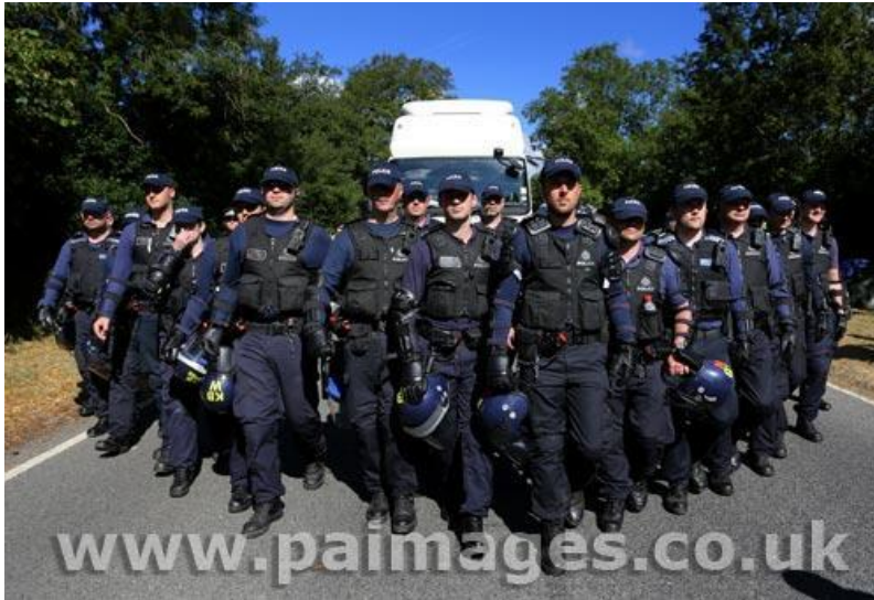
Sussex public order unit doing photo-shoot for their latest bondage look

The 2 nd -3 rd week of August saw a significant escalation of the campaign (and resulting police response), as the national campaign group no Dash For Gas 10 decided to re-locate its planned Reclaim the Power (RTP) camp to Balcombe in solidarity with the campaign. This was held from August 16-21 st and attracted experienced